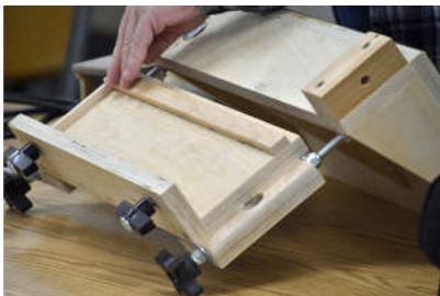
Micro-adjustable re-saw fence for band saw