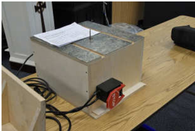
Sabre saw conversion to table mounted.