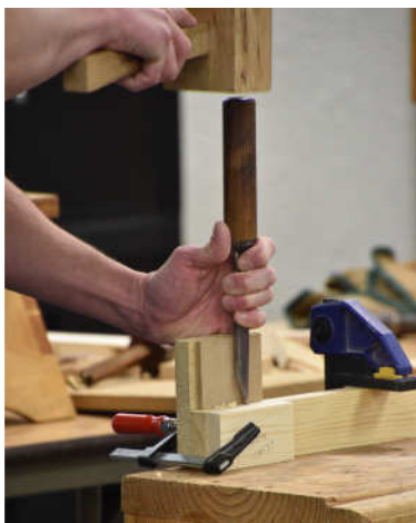
Chad Stanton cuts mortises