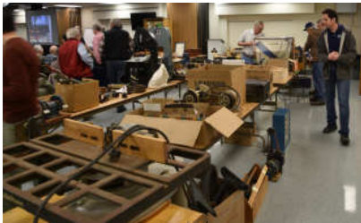
Tools auctioned in January