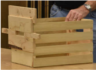
Making an apple crate from scrap wood