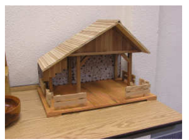
Display for Christmas Nativity Scene built by Ron Frame.