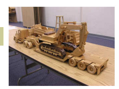
Toys with amazing detail built by Karl Buck.