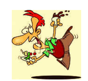
<u>Please Clean It Up.</u>