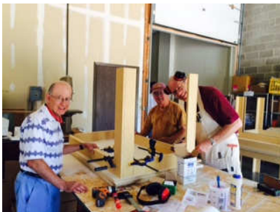
Assembling furniture at New Life Furniture Bank