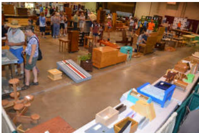
4-H Woodworking judging at the Ohio State Fair