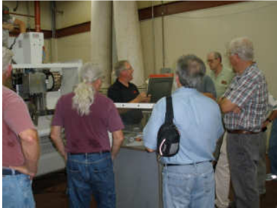
Members enjoy a field trip to The Woodworking Shop in Miamisburg