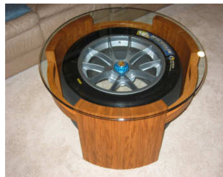
Howard Renner's coffee table