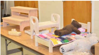
Toys ready to go to CAP in November. Don't forget to bring your toys to the November meeting, boxed up and ready to send to Kentucky.