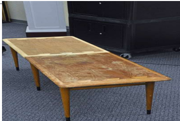
Mid-Century Modern Rescue