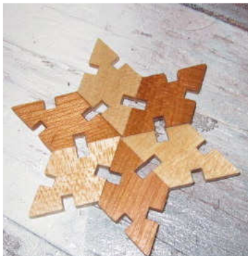
Keith Mealy has posted a link to a video on how to make the snowflake / star ornaments on the club web site (under Forums).