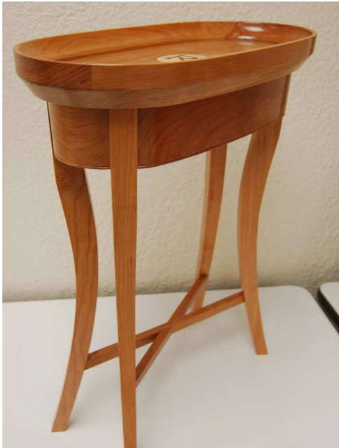
Howard Renner built this oval side table